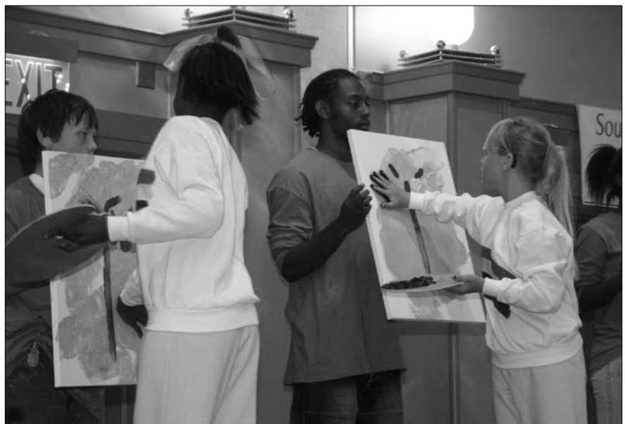
Youngsters from the S.C. School for the Deaf and the Blind show off their finger-painting skills.

Plans for the 38th annual SERID conference, scheduled for Oct. 22–27, 2008, in Atlanta, are already under way. For more information, go to www.serid.org .