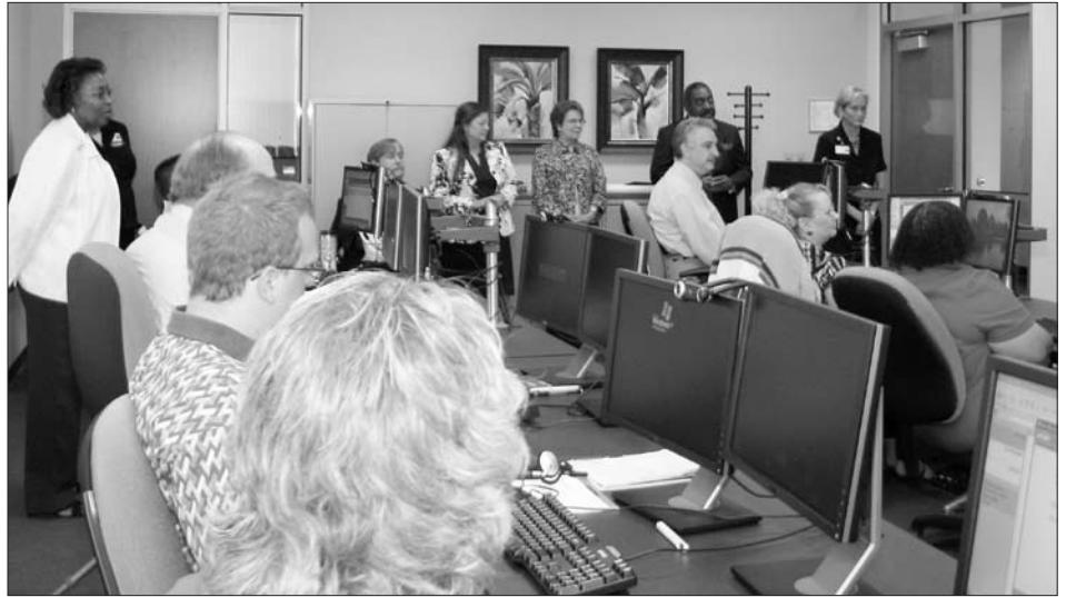
Agency board members, guests and staff members tour the Information Technology distance learning classroom during the June 11 dedication.

The second part involves EditU.org, an online campus for people with disabilities and the people who serve them. It features assistive technology such as screen readers, shortcut keys for all mouse actions, alternative images to replace